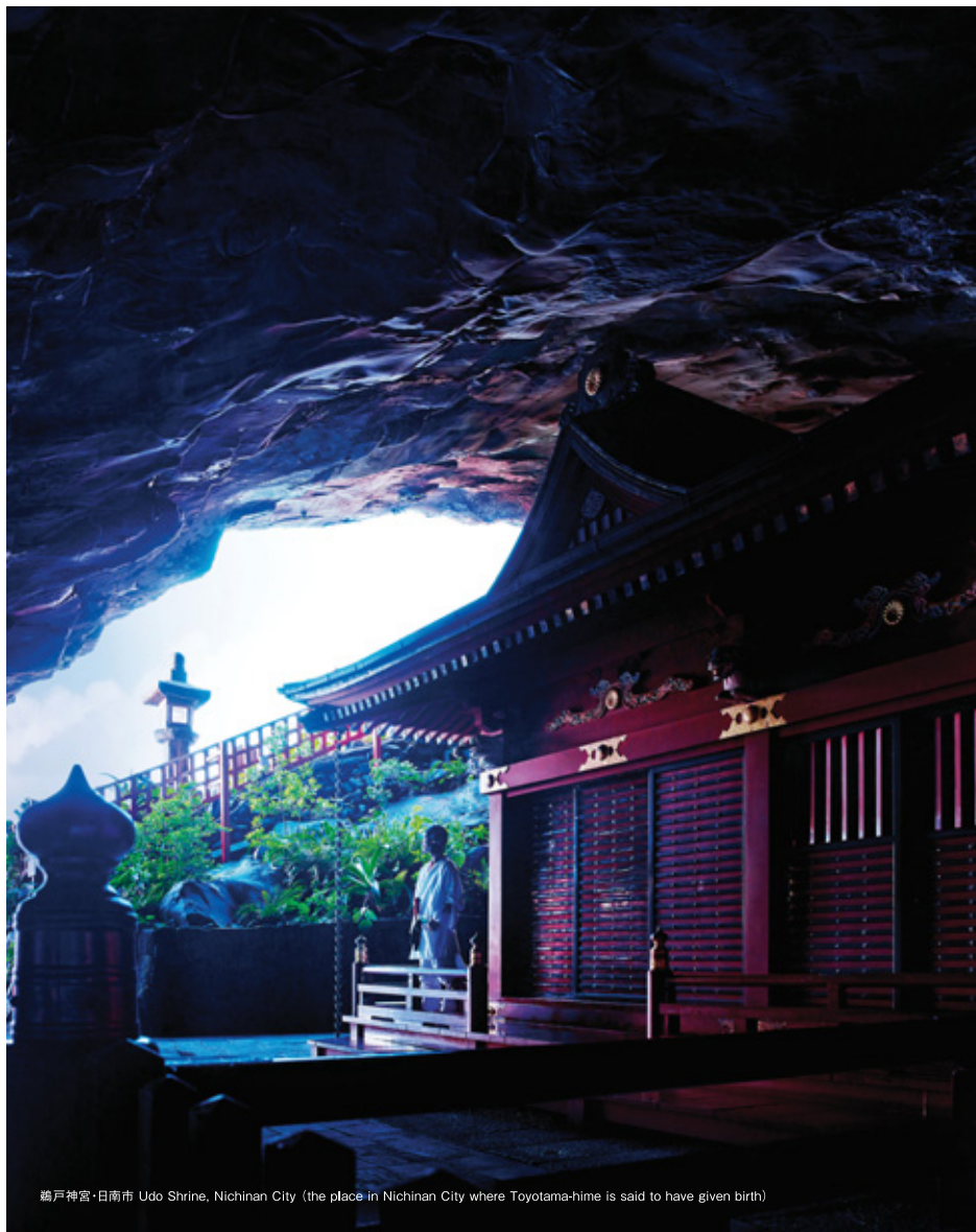
鵜戸神宮・日南市 Udo Shrine, Nichinan City (the place in Nichinan City where Toyotama-hime is said to have given birth)