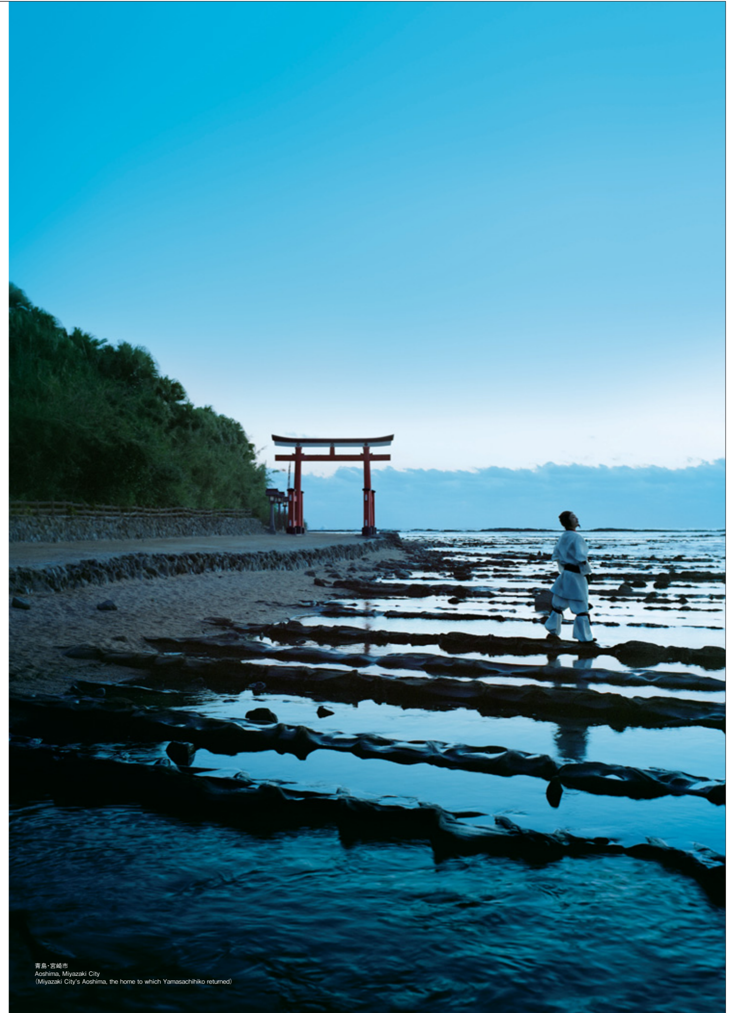
青島・宮崎市 Aoshima, Miyazaki City (Miyazaki City's Aoshima, the home to which Yamasachihiko returned)

呪文を唱えて釣針を返すと、海幸彦は貧しくなり、山幸彦をねたんで攻め込めます。しかし、不思議な珠の力で海幸彦を降参させ、海幸彦は山幸彦に仕えるようになりました。