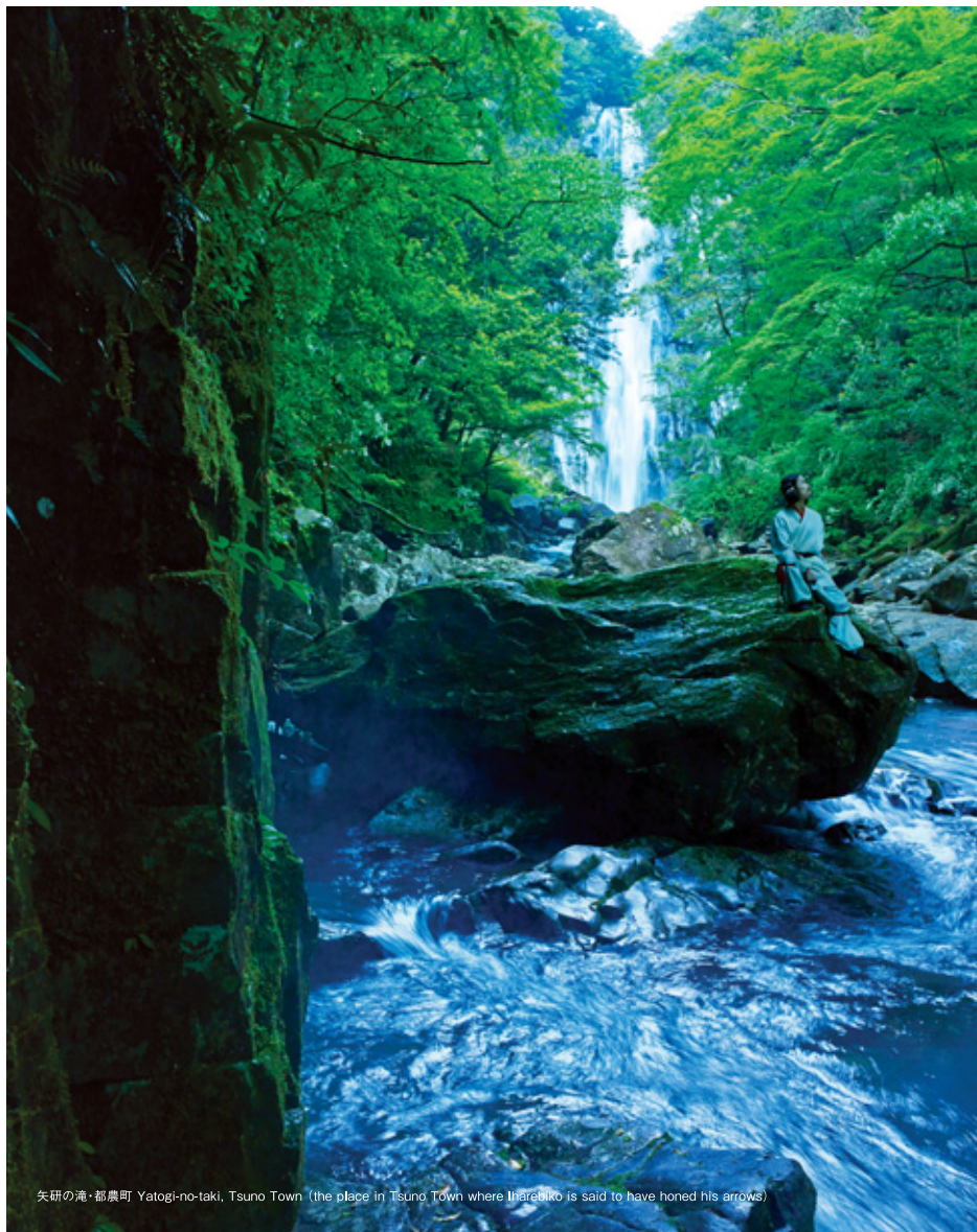
矢研の滝・都農町 Yatogi-no-taki, Tsuno Town (the place in Tsuno Town where Iharebiko is said to have honed his arrows)