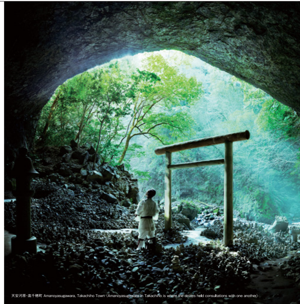
天安河原・高千穂町 Amanoyasugawara, Takachiho Town (Amanoyasugawara in Takachiho is where the deities held consultations with one another)

そのとき、太陽の神アマテラスと月の神ツクヨミ、海を司るスサノヲの神々が誕生しました。