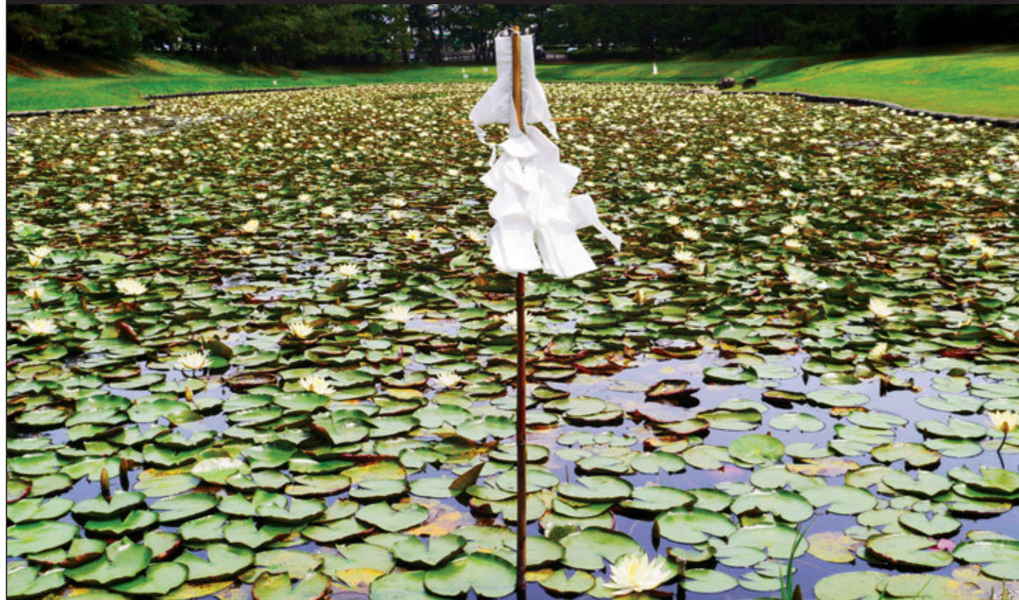
みそぎ池・宮崎市 Misogi Pond, Miyazaki City (the pond where Ninigi purified himself, Miyazaki City)

The Kojiki and Nihon shoki—Japan’s oldest extant historical texts—both begin with myths.