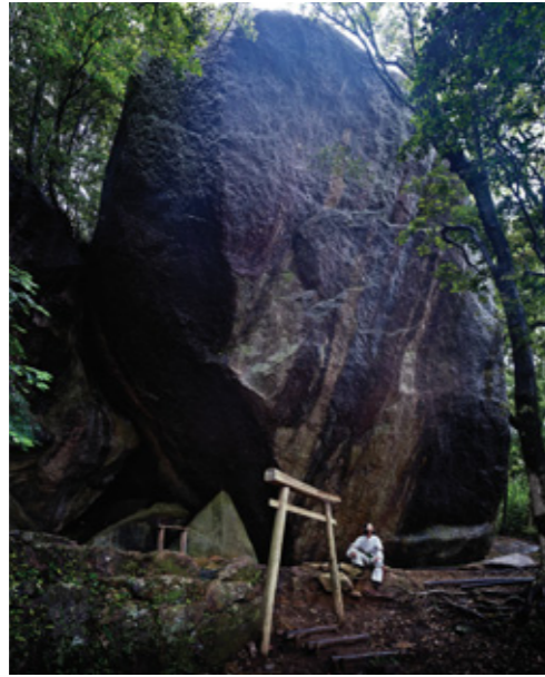
神々山・延岡市 Kamisan-yama, Nobeoka City (the place in Nobeoka City where Yamasachihiko is said to have lived)