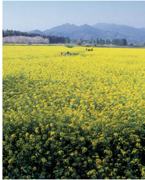
西郡原・西都市 Saitobaru, Saito City (site in Saito City from the tale of Ninigi and Konohanasakuya-hime)